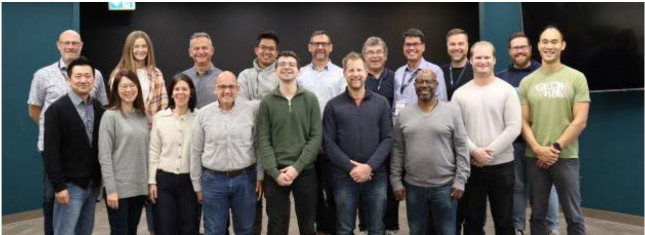
School of Orientation attendees November 2022