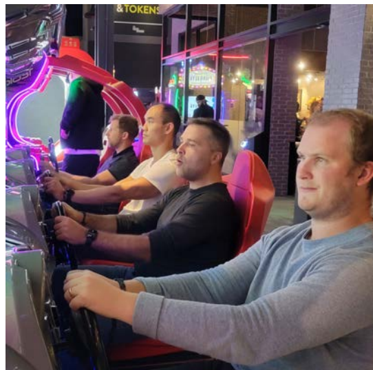
Fun night at the REC Room