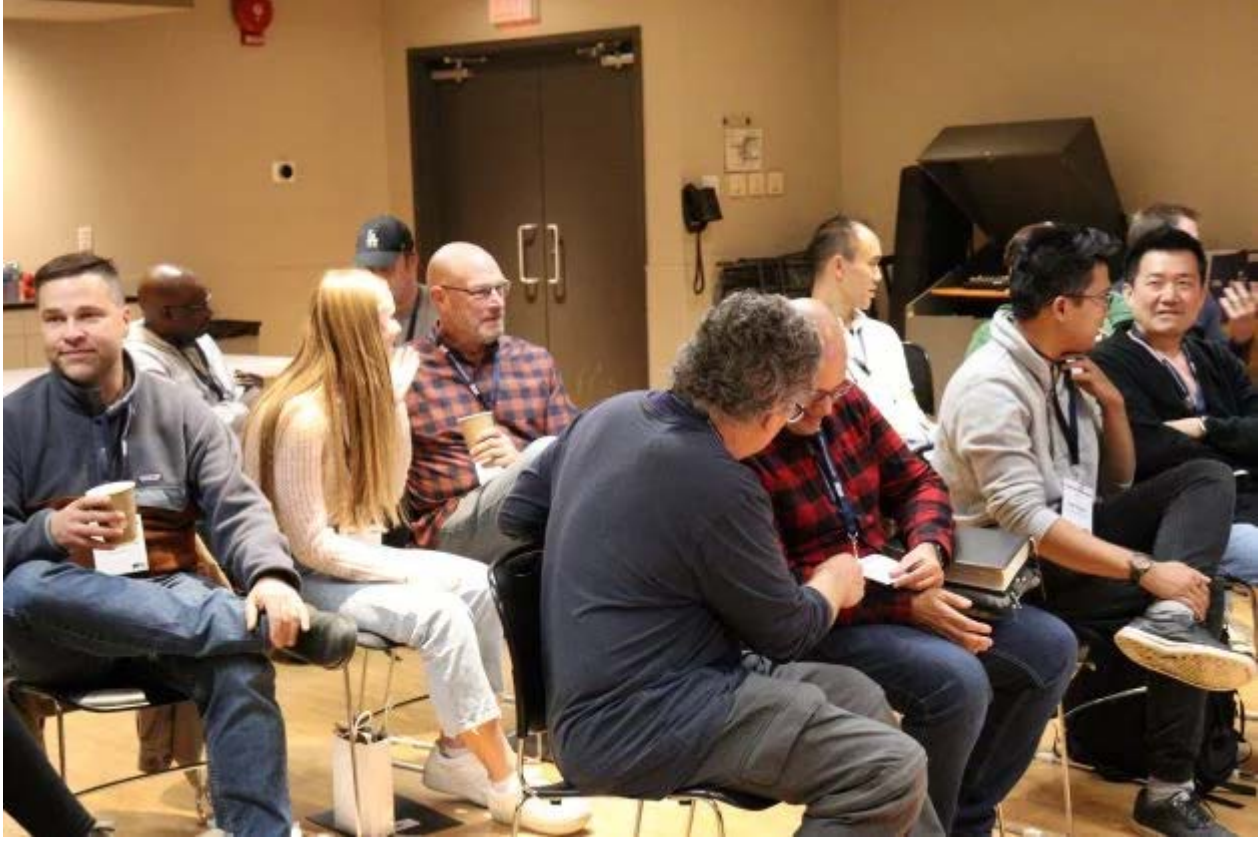
Group discussion, opening evening of School of Orientation