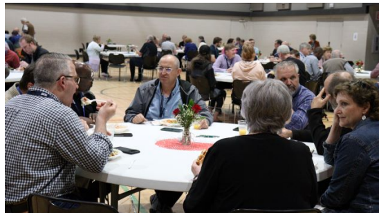
The 3 Fs of Fellowship, Friendship, and Food