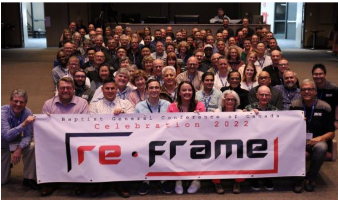
Group Picture of Celebration 2022 attendees