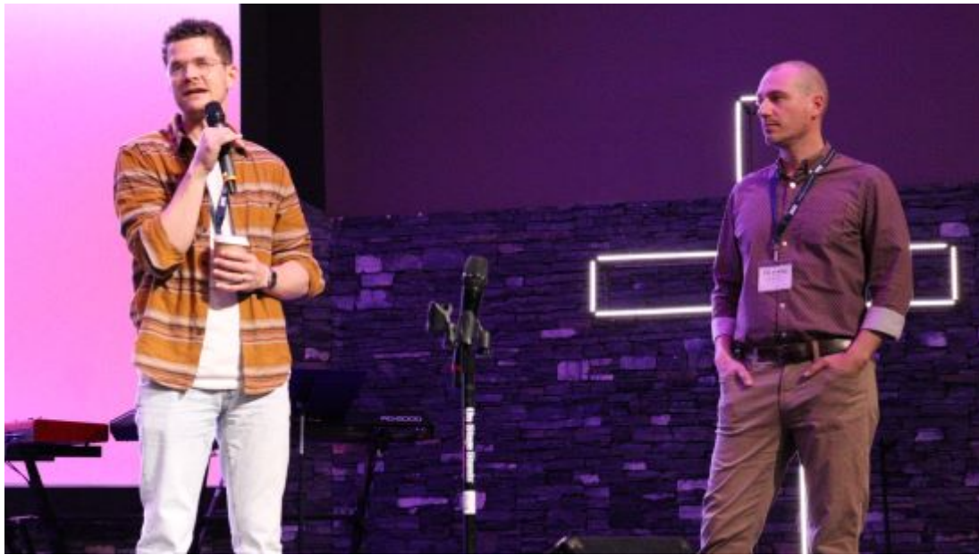
A few of our BGC pastors also contributing to Celebration this year