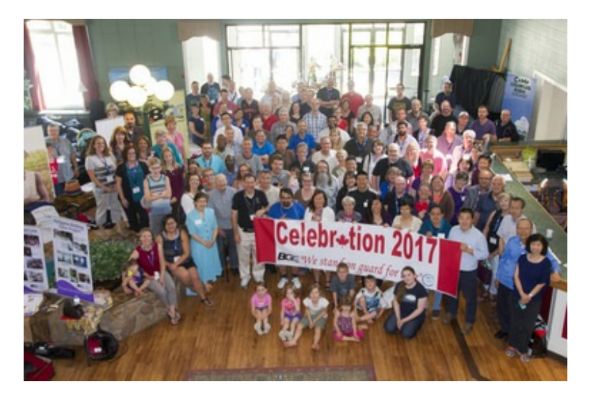
Prayer, Prayer and More Prayer