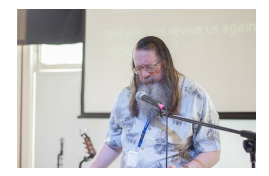
Women's Ministry In an Era of Change Workshop