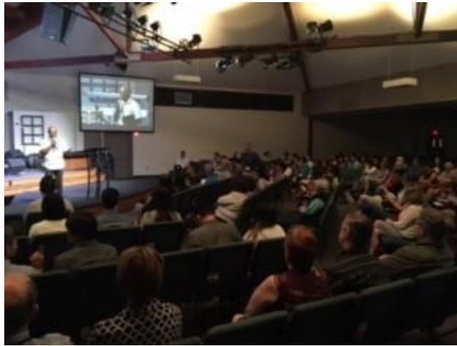
Panel Discussion at BCBC Meeting