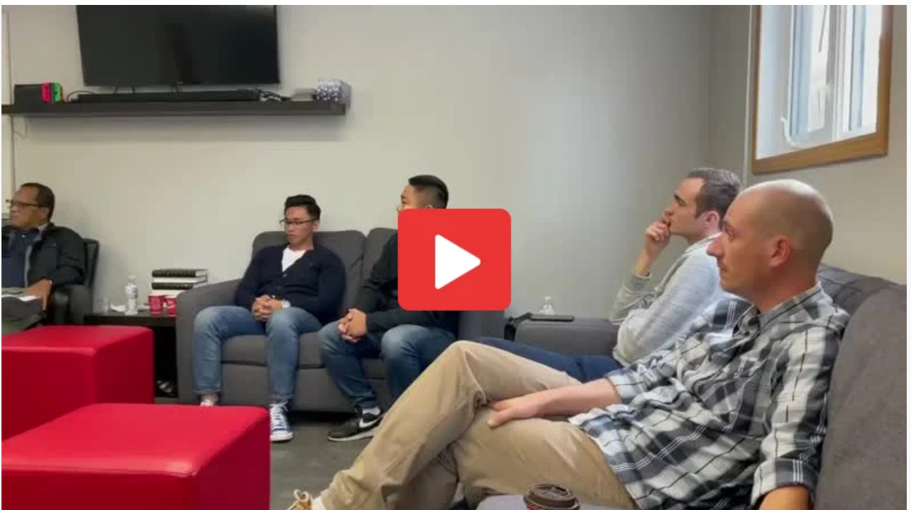
Pastors meeting in Winnipeg