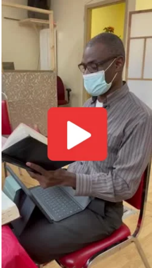
Pastor's meeting in Montreal