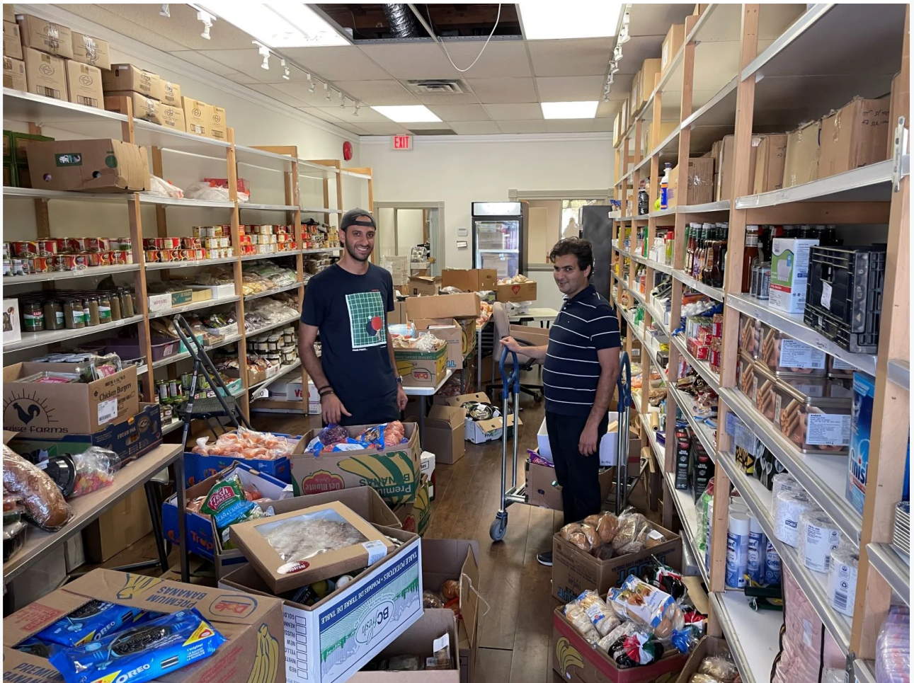
House of Omeed staff at food pantry